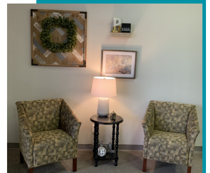
Pictured above are dedicated volunteers.