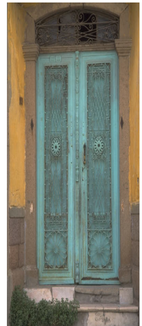
BATP's Self-Reliance Program opens doors for those seeking personal freedom